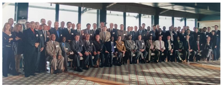
ITGA AGM Portugal, 2002