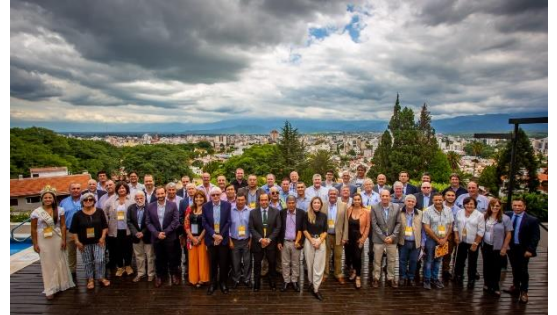
ITGA Americas Regional Meeting Argentina 2023