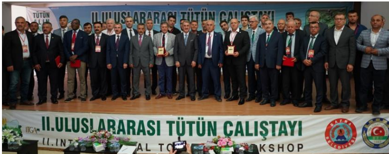
ITGA Regional Meeting Turkey, 2019