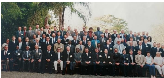
ITGA AGM Brazil, 2000