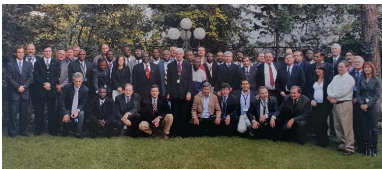
ITGA AGM Italy, 2006