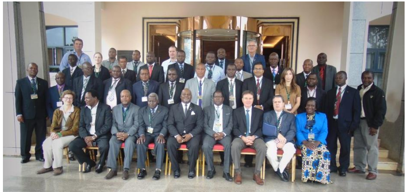
ITGA Africa Regional Meeting Zimbabwe, 2015