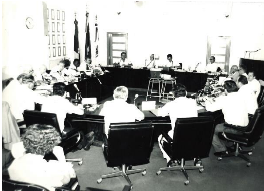
ITGA Foundation Working Table, 1984