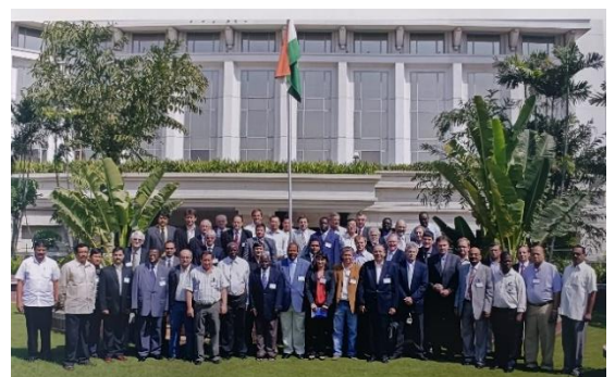
ITGA AGM India, 2009